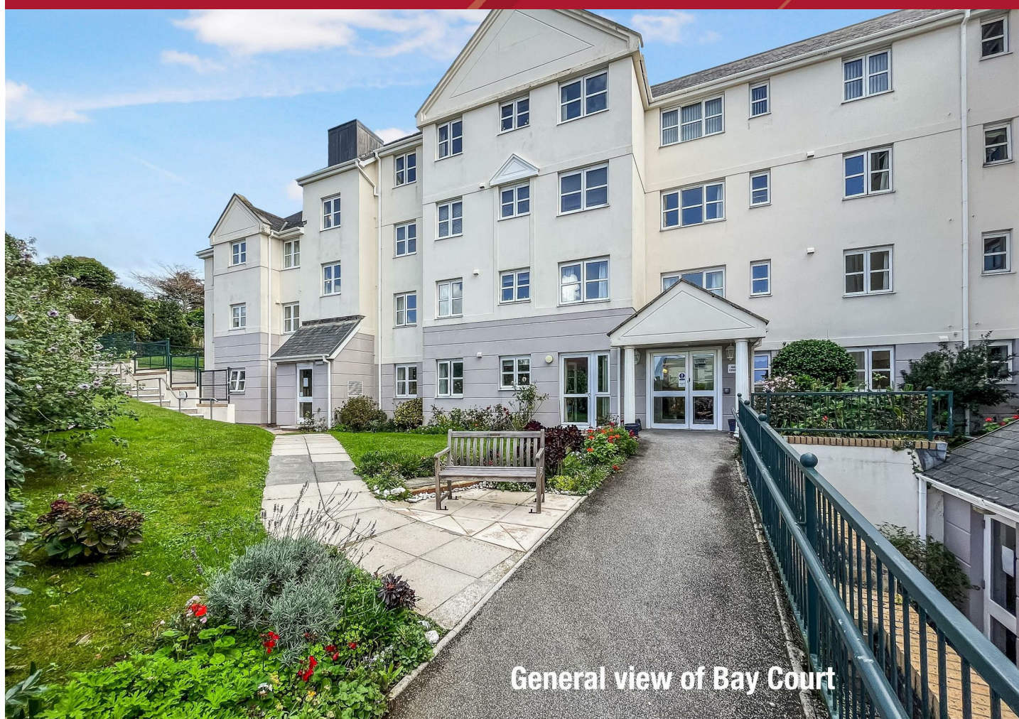
General view of Bay Court